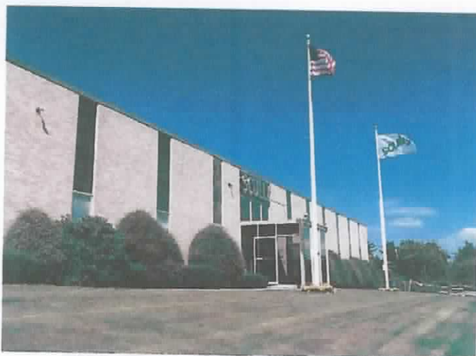
Scully Headquarters in Wilmington, MA U.S.A.